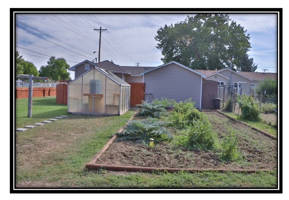
Garden And Green House